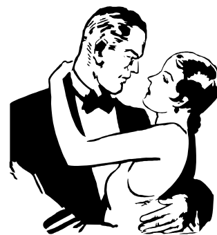
Veromax can help your libido