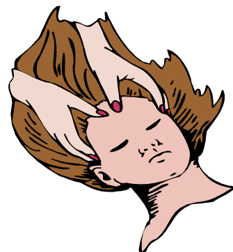
Indian Head Massage has many benefits

Indian head massage does, of course, have many other benefits. It can be extremely effective in relieving stress, inducing relaxation and enabling clearer thinking. Clients often achieve an overall sense of well-being after treatment and report improvements in conditions such as sinusitis, headaches and throat problems.